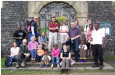
A day outing to Tissington

We also organise informal social events, lunches and day trips in the countryside. We play 5 a side football, organise an annual holiday & much more!