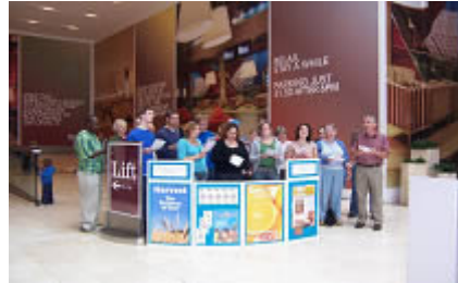
Singing in the Westfield Centre

All kinds of people of all ages and backgrounds come to Castlefields Church. You may have seen us singing hymns in the Westfield Centre – something we enjoy doing a number of times each year