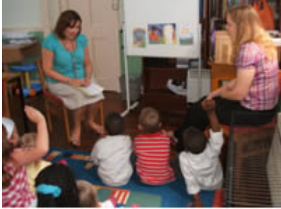
A Sunday School Class

There is a Sunday School after the Sunday morning meeting. We run occasional children's clubs in the school holidays.