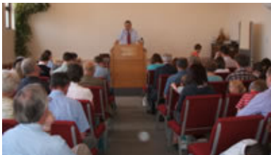
Listening to the preaching at a morning service

Everyone is welcome – you don't need to be a Christian. Just come along to watch and listen. Hear teaching from the Bible. Learn about Jesus Christ. Ask questions. Talk to others.